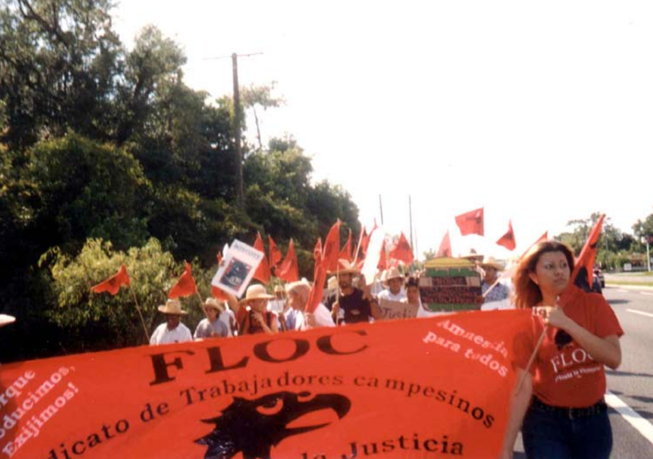
FLOC members march in 2000 supporting Mt. Olive pickle workers in North Carolina.

people die periodically like that here and nobody says anything, let alone does anything about it, friends, this is not what America is supposed to be.