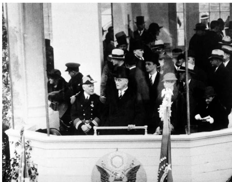
According to Jim, the U.S. is in a 1933's kind of moment.

A couple of examples: I know y'all are involved in one of these and that's the blue-green alliance, labor with environmentalists. Developing a whole new economic possibility, independence from foreign oil, indeed independence from any oil, based on green jobs that hold so much more potential in terms of numbers of jobs and in terms of the pay of those jobs. Investing in retrofitting all our buildings for conservation purposes based on solar and wind power and all