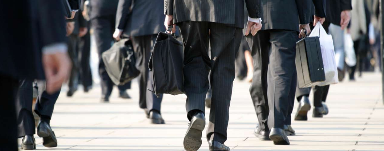
Jim Hightower told the crowd that every day, Washington, DC is flooded with 13,000 corporate lobbyists.

countryside. It's the very Wall Street bankers, the creeps and the crooks and the incompetents who knocked us down, who crashed the economy. They looked at that pile of bailout money, sent their lobbyists to Washington and the lobbyists jumped on that money like a gator on a poodle. I mean it was instantaneous. There are 3,000 lobbyists out of those 13,000 that work for Wall Street.