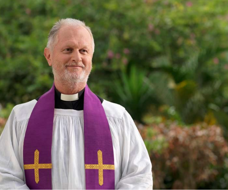
In his talk, Mr. Hightower discussed the value of new alliances, for example, environmental organizations partnering with conservative Christians who are interested in "Creation Care."

the other alternative energy possibilities. Based on taking those machinists that Boeing Aircraft said they don't need because they are going to go to China to make their airplanes. Well, let's put them to work and build a high-speed train between all of our population corridors. We have a lot of opportunities out there. And the blue-green alliance has come together, led by the Sierra Club, the largest membership environmental organization, and the Steel Workers, the largest industrial union in our country, and now is growing by leaps and bounds. Barack Obama has essentially embraced it, not as fully in the budget as needs to be done, but nonetheless embraced the concept. And, a guy named Van Jones, who is terrific, who headed an organization called Green for All, is now in the White House - another big change taking place. That is one example.