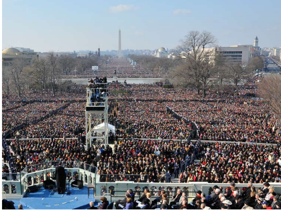
Jim Hightower told Forum participants that the election of President Obama is just the beginning and that he believes the role of the grassroots pressure is more important than ever.

I got to tell you I had mixed emotions January 20th. I was there in front of my TV in Austin, Texas watching that crowd that filled back to the Capitol, to the Washington Monument and back to the Lincoln Memorial and back on across. A couple of million people were out there. Now I got the goose bumps and felt the heart palpitations and all that. But I had mixed emotions watching him